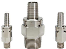
FAST FITTING KIT (#2000476)