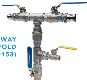
LEACHATE 2-WAY DISCHARGE MANIFOLD (#2000153)