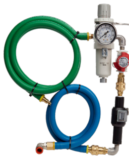
AIR REGULATOR KIT (#200068)