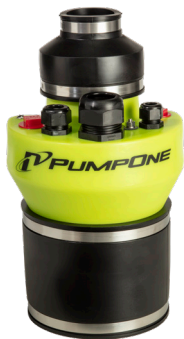
6 in. WELL SEAL (#2000336)